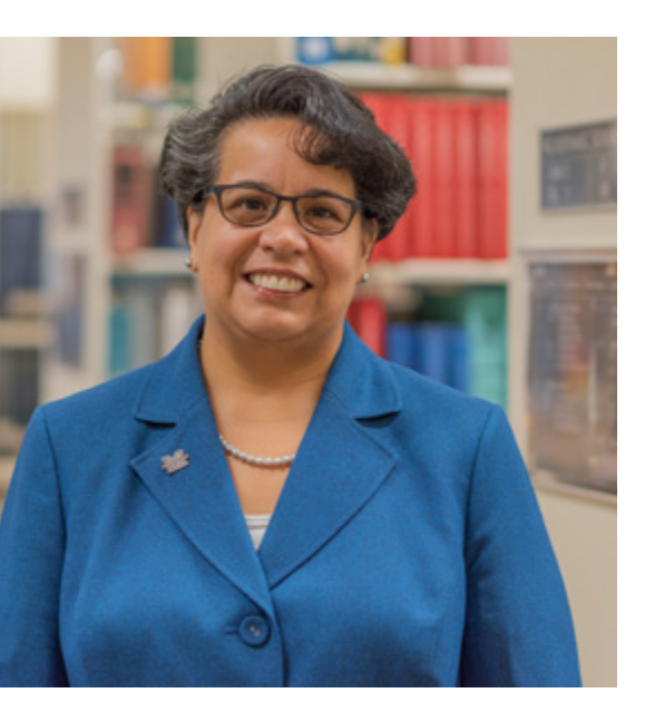
"For student success, being available 24/7 with technical support is very important."

instantly on their phones. For example, Marshall leverages the notification solution to communicate a campus closing due to inclement weather.